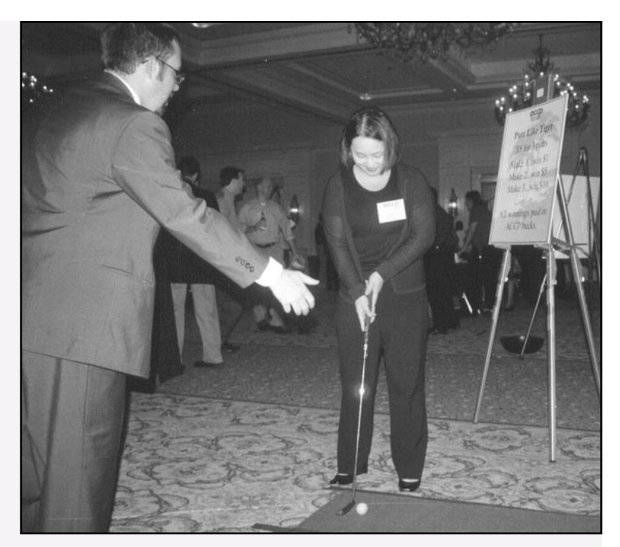
A PRN member helps instruct contestants at the golf game, which was part of the 2001 Silent Auction to benefit the ACCP Research Institute.